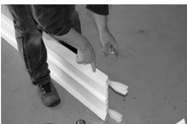
Plane and insert variable corners.