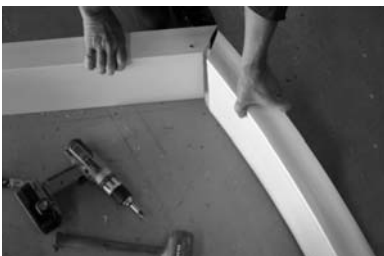
Fasten variable corners and join arch and strut pieces.

What is the best way to use the variable corner connectors?