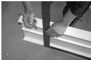
Transfer intersection points.