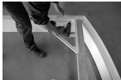
Brace using spreader and VBRACE™.

When VBUCK® is shaped the chamber size is changed. Variable corner connectors are made slightly larger to accommodate for this change. We do this, so builders can be assured of a tight fit when assembling shaped block-outs. Use a small block plane to adjust the size of your variable con-