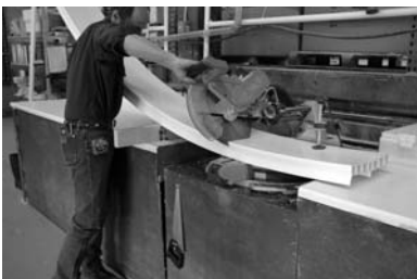
Cut angles with sliding miter saw.