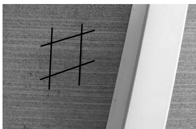
Plot arch intersection.

4- Assemble by inserting two variable corner connectors in chambers to secure lintel to struts.