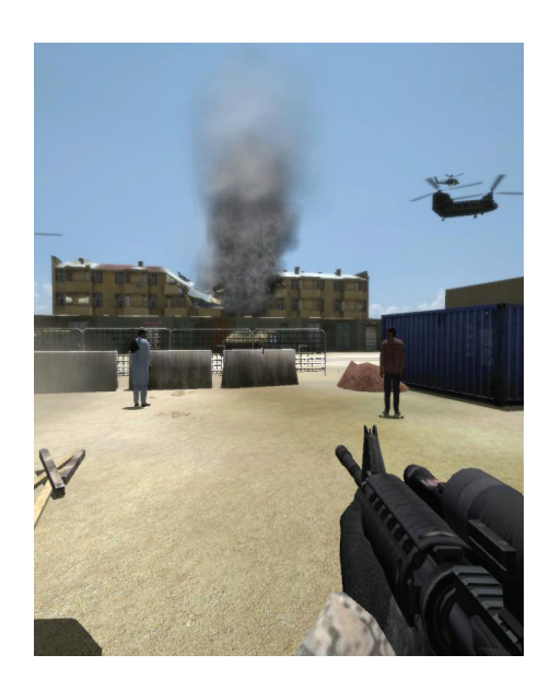
Correlated terrain output generated by Terra Vista for VBS2.

BAE, Selex, AgustaWestland, ESG, GE-Fanuc, Krauss-Maffei Wegmann, Kongsberg, SAAB, and many others.