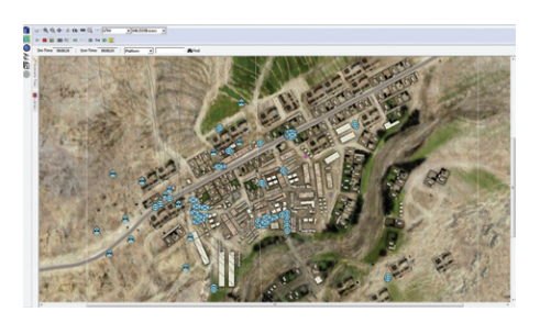
Correlated terrain output generated by Terra Vista for STAGE.