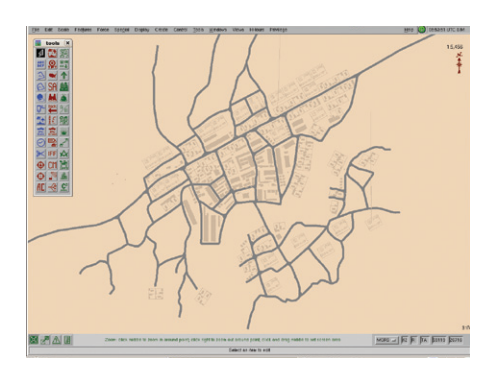
Correlated terrain output generated by Terra Vista for JSAF.