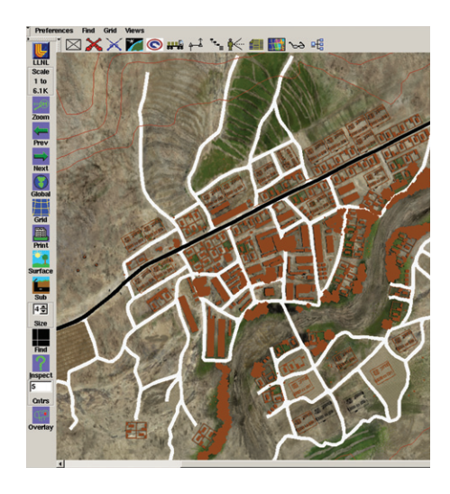
Correlated terrain output generated by Terra Vista for JCATS.

To maximize reusability and to help lower user costs, Terra Vista also supports and embraces open standards, including OpenFlight and Common Database (CDB).