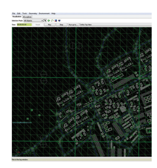
Correlated terrain output generated by Terra Vista for AI.implant.