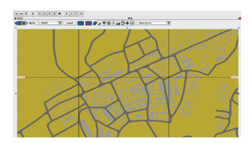
Correlated terrain output generated by Terra Vista for OneSAF.